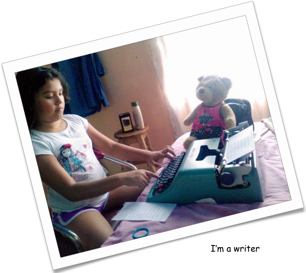
I'm a writer